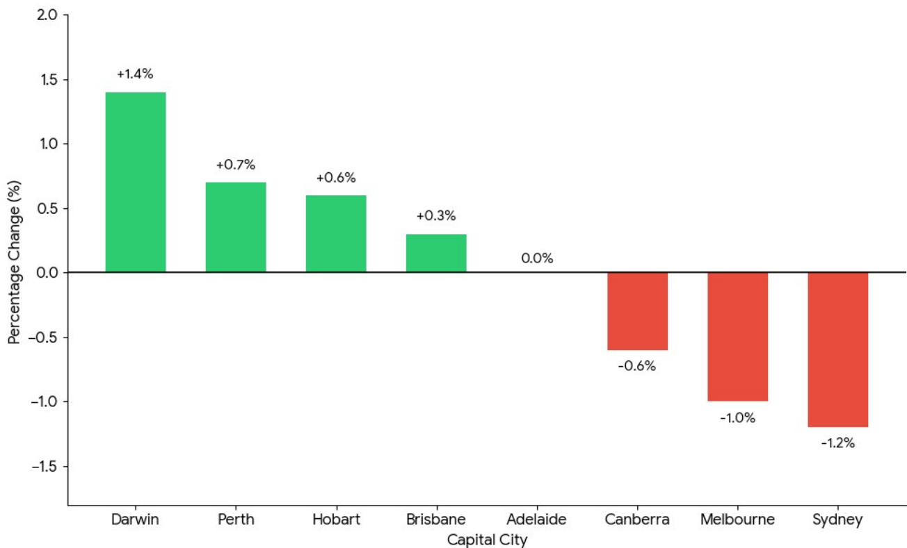
Capital City Monthly Change in Dwelling Values (June 2026)

The downward movement in national home values was primarily driven by substantial corrections in the largest capital cities. Across the combined capital cities, values dropped by 0.6% in June alone, culminating in a 1.3% loss over the June quarter.